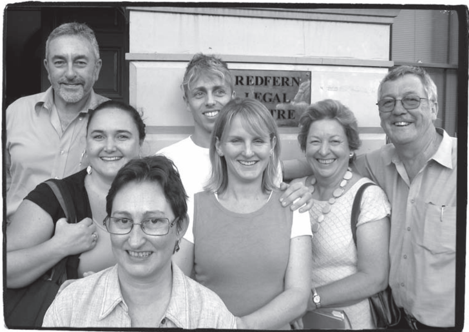
Redfern Legal Board and EO